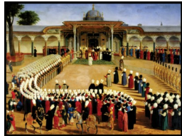
Sultan Selim II's Reception, Konstantinos Kizikinos