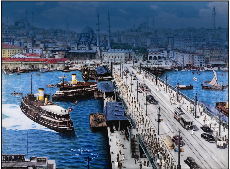
Galata Bridge